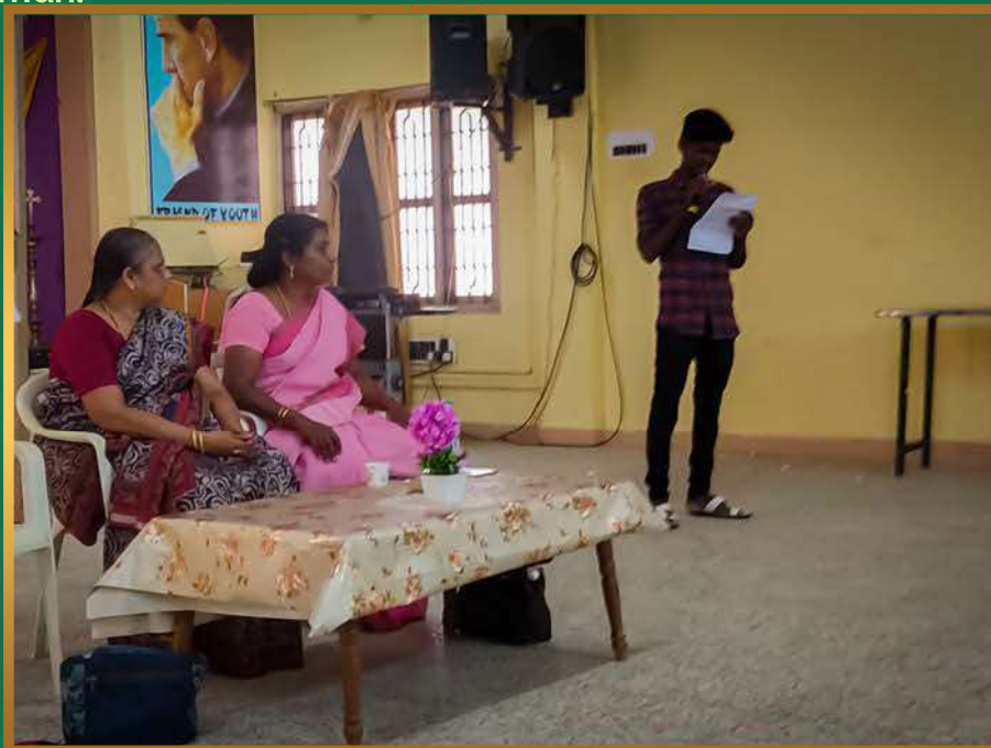
Welcome speech delivering by the trainee