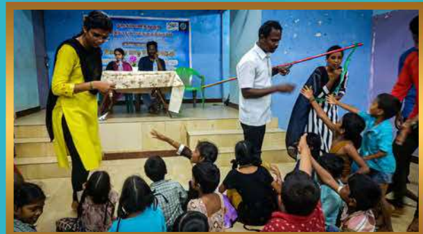
Trainees distributing pencils to all the children