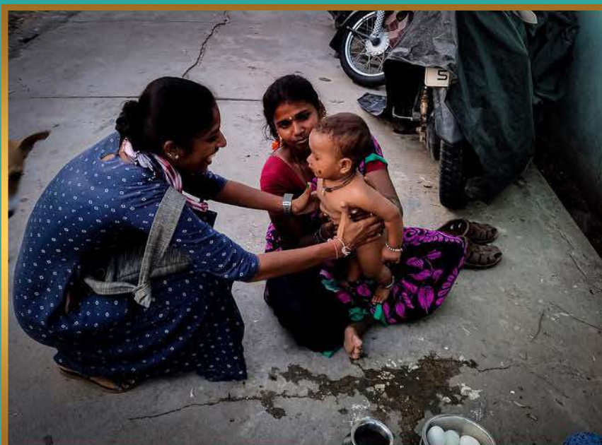
Trainee's love towards the baby.