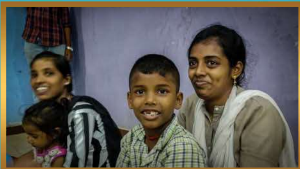
Trainees enjoy with Housing Unit children