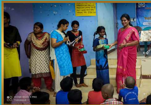
Children happily receiving the prize from the Associate professor