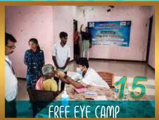
FREE EYE CAMP