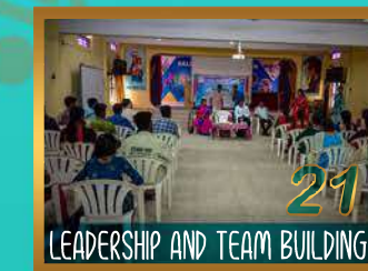
LEADERSHIP AND TEAM BUILDING