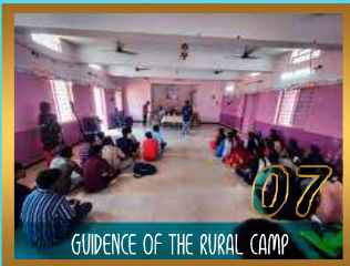
GUIDANCE OF THE RURAL CAMP