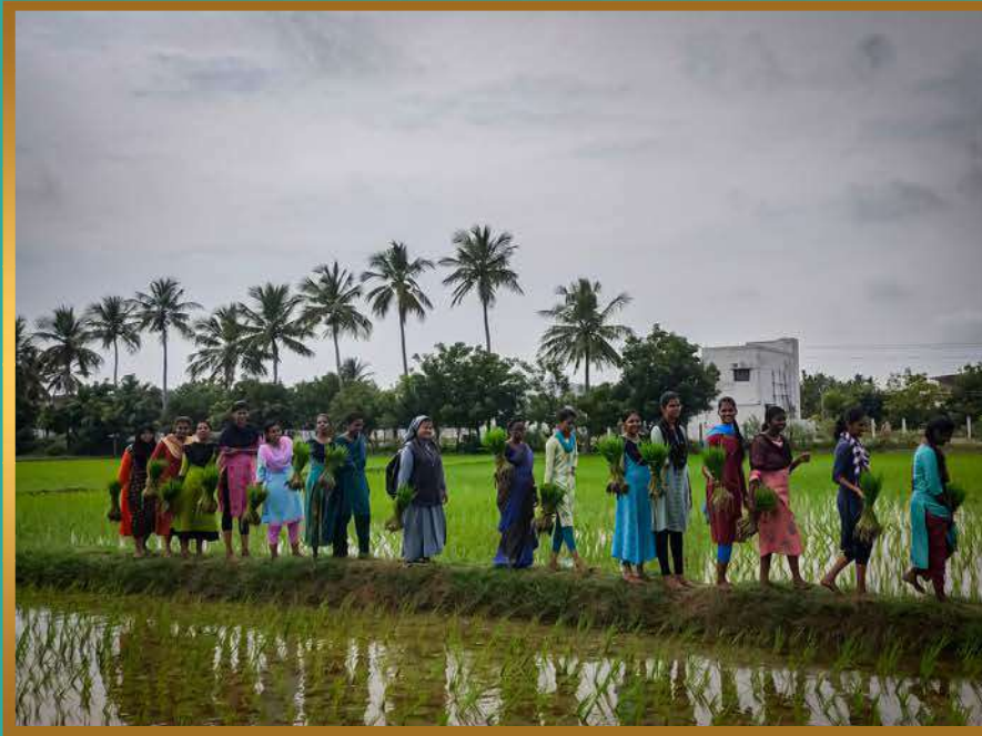
Trainees going to transplanting along with the farmers