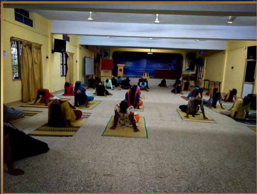
Trainees practicing asanas with the guidance of yoga trainer

As a beginning of the third day of rural camp, yoga & meditation was conducted for the students for an hour.