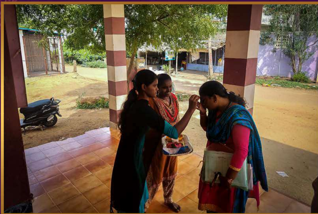
Trainees formally greeting the resource person