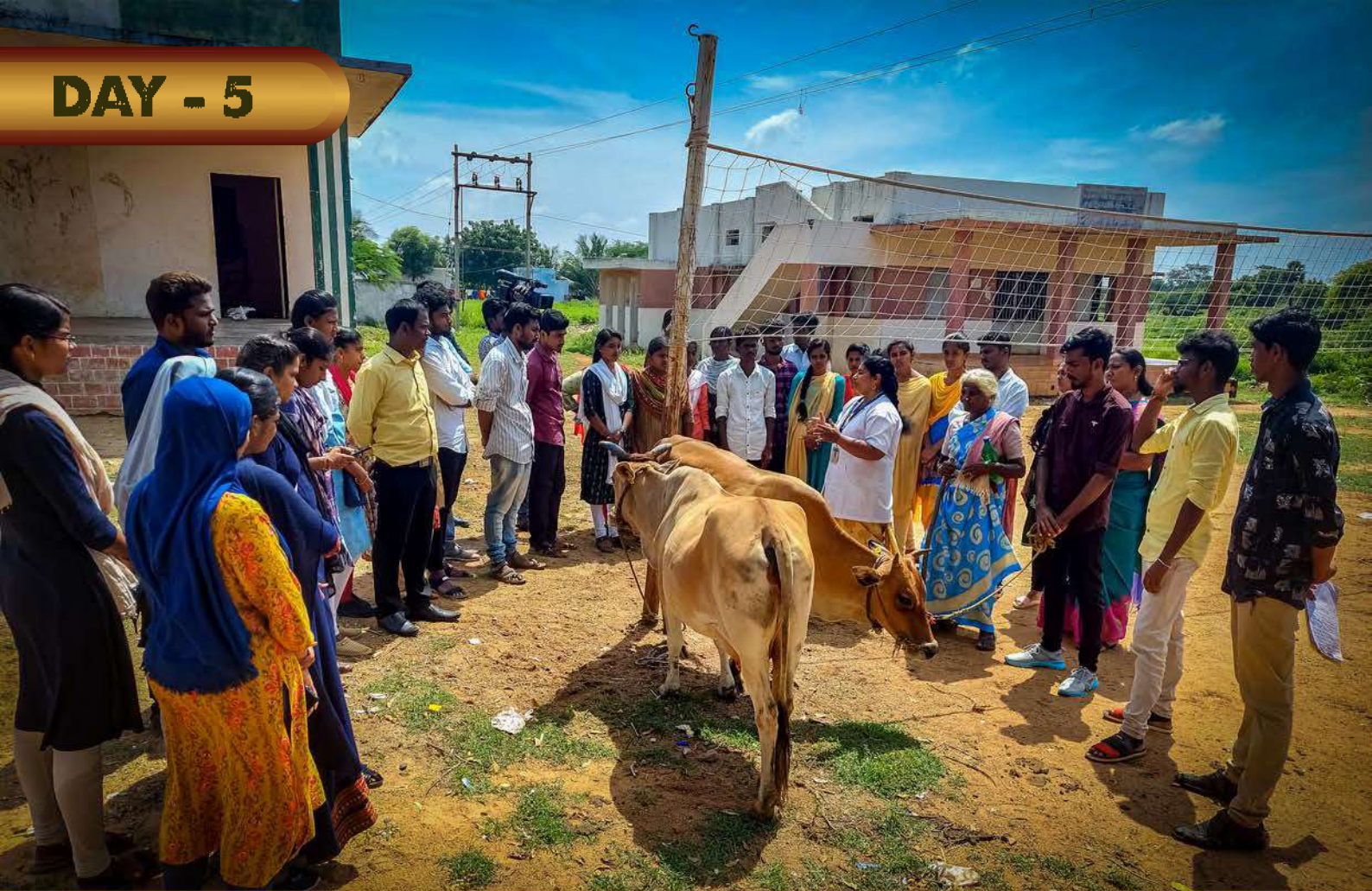
Veterinary doctor explaining to the trainees on the necessity of domestic animals