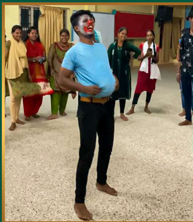
Cultural performance by a trainee