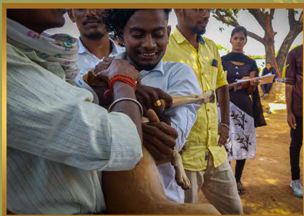
Vaccinating the dog