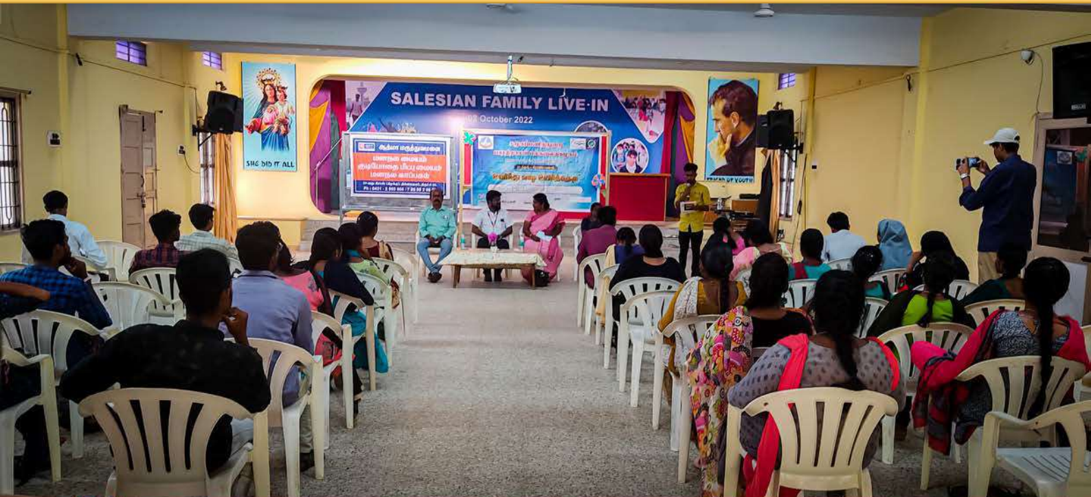
Master of ceremony brought off by the trainee