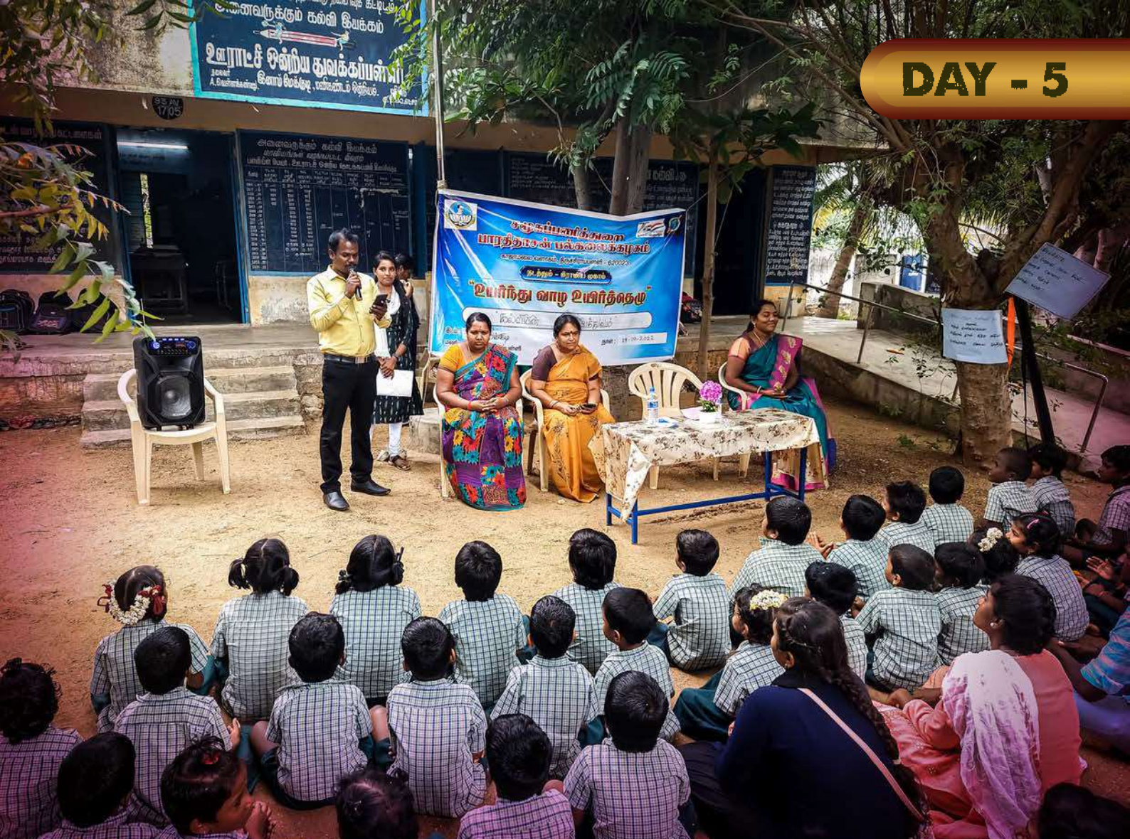
Resource person's speech on importance of education among primary school students