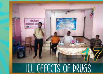
ILL EFFECTS OF DRUGS