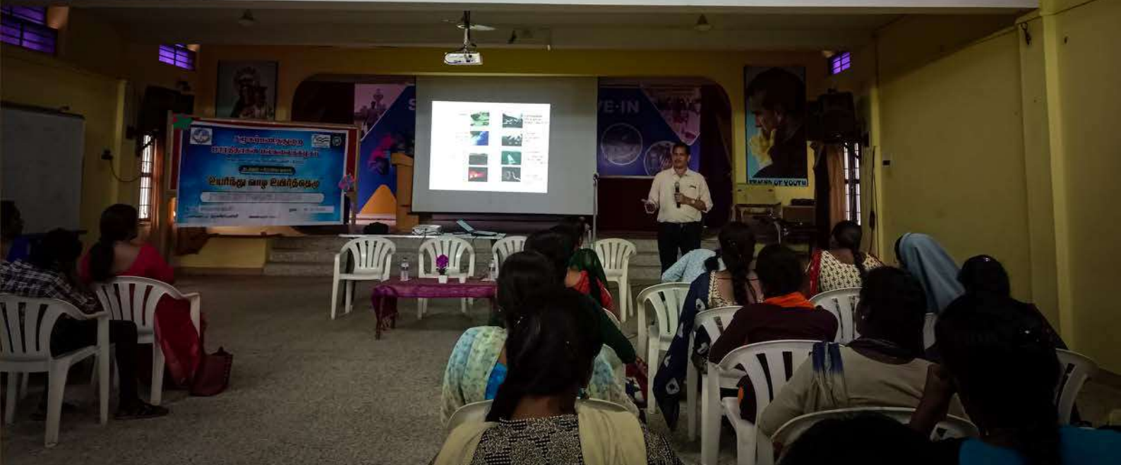
Resource person illustrating the disaster management through visual presentation