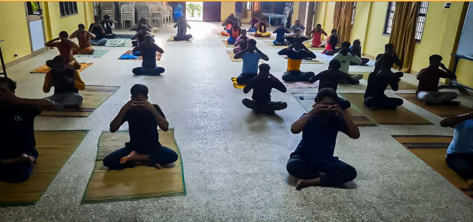
Trainees practicing meditation

As a beginning of the third day of rural camp, yoga & meditation was conducted for the students for an hour.