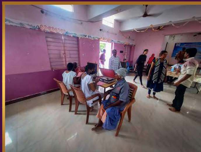
Nurses checking the Snellen Eye Chart test for the people

Bharathidasan University organised the Free Eye Camp programme, 1 st MSW Trainees collaborated with Joseph Eye Hospital. The free eye camp was conducted for the people in the community hall at Nagamangalam. More than 100 people benefited through this free eye camp and got proper treatment.