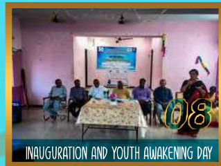
INAUGURATION AND YOUTH AWAKENING DAY