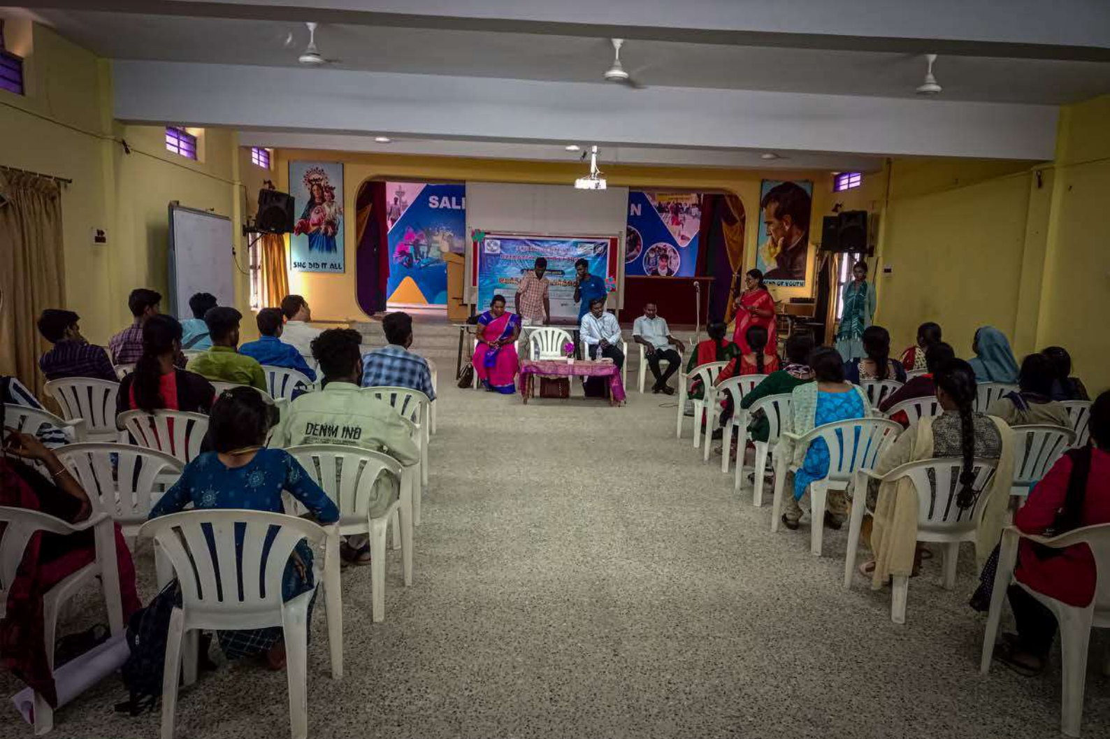
Associate professor's felicitation to the resource person