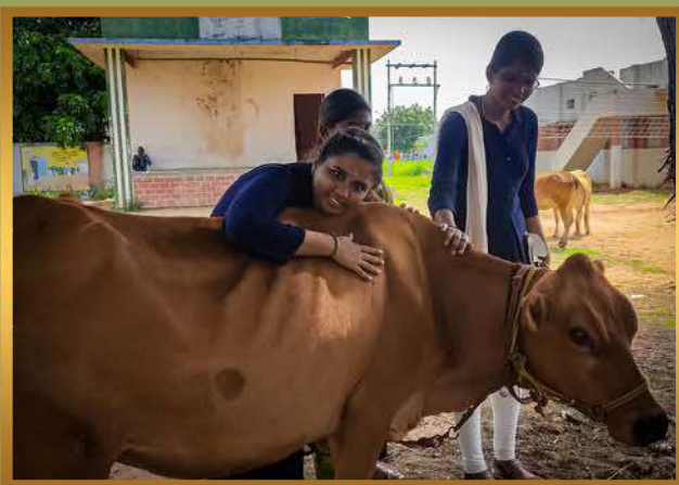
Trainees love and care towards animals