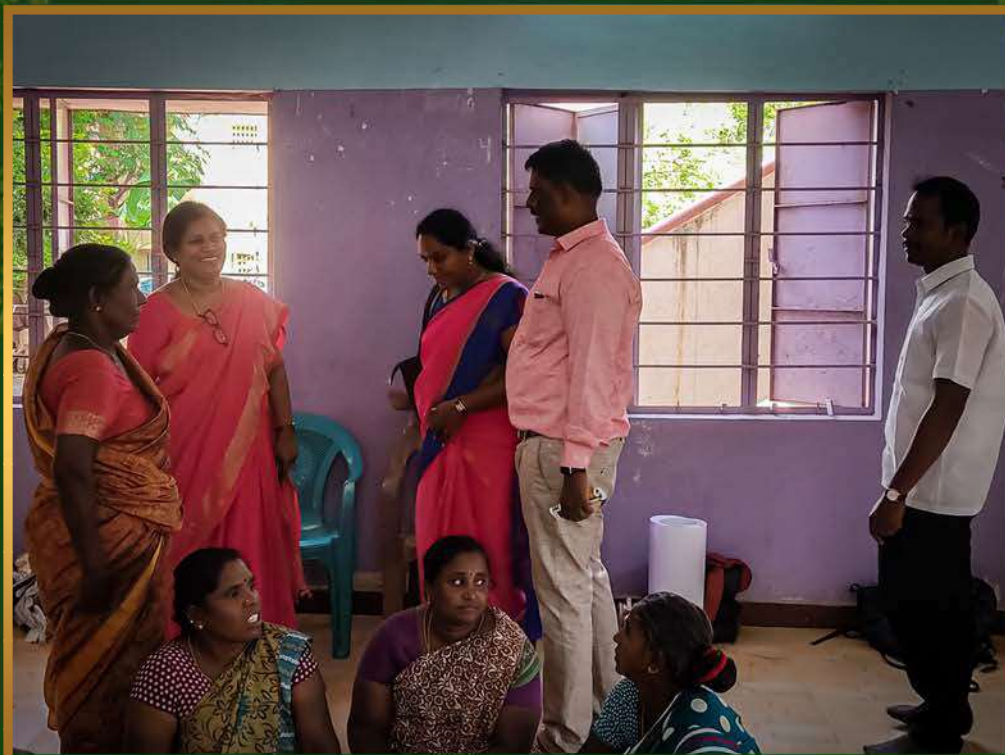
Professors friendly interaction with the localities