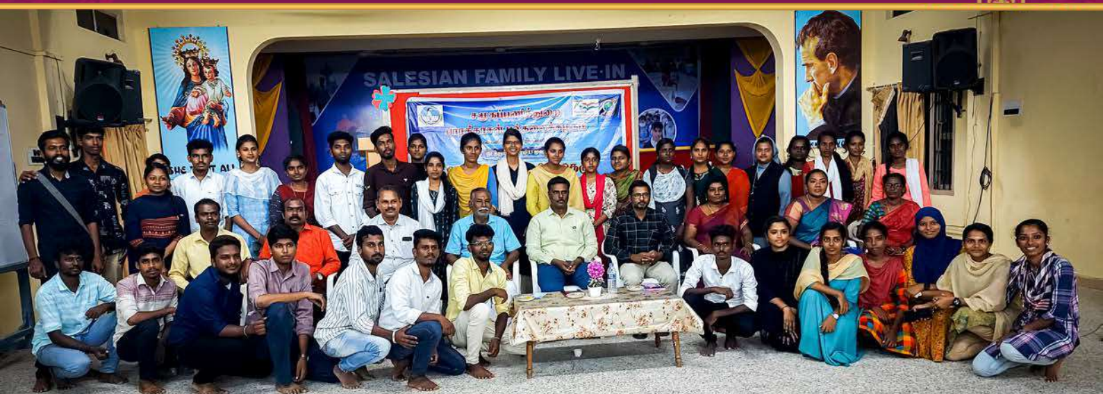
A view on staff and 1 st MSW Students in Validation ceremony