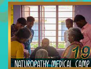
NATUROPATHY MEDICAL CAMP