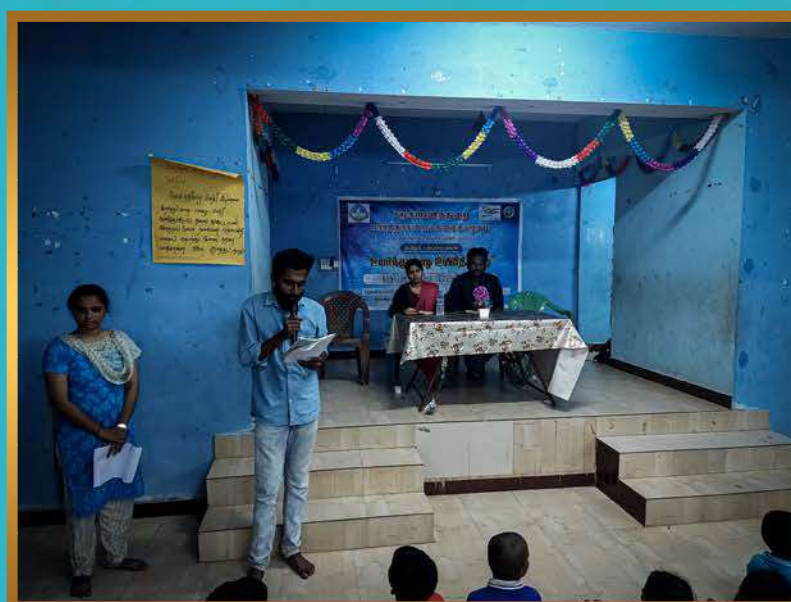
Trainee welcoming the chief guest with pleasant greetings