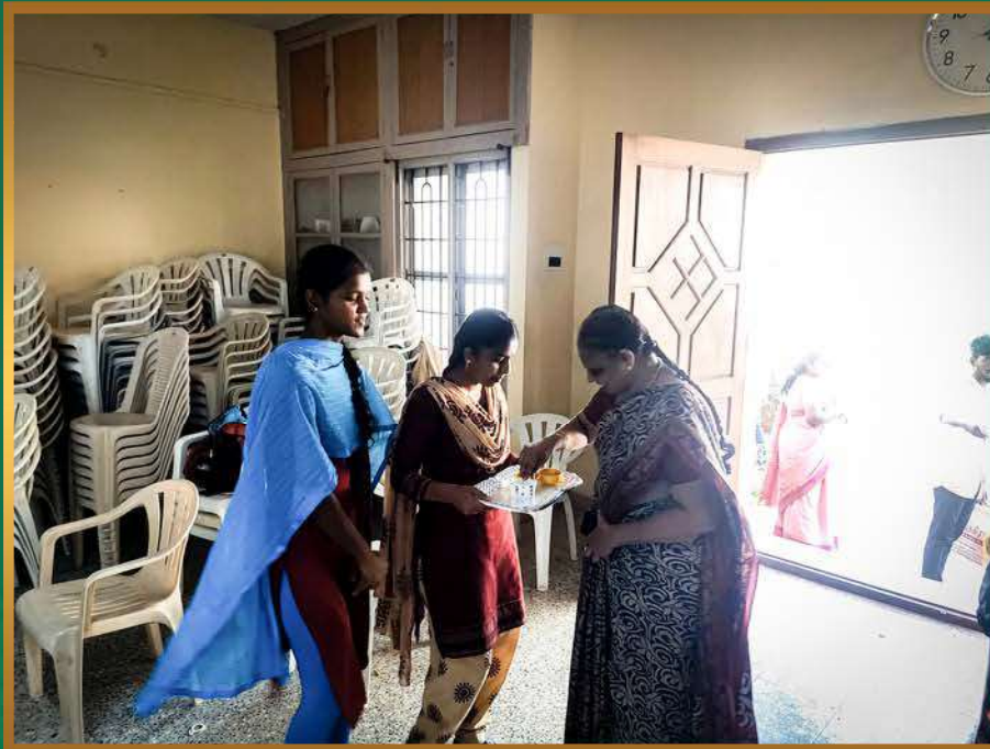
Trainees inviting the resource person