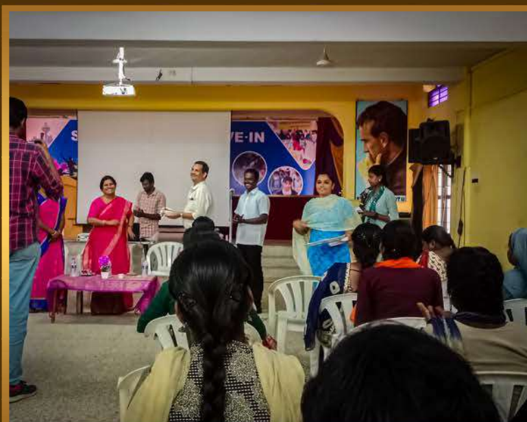
Associate professor's honouring the chief guest