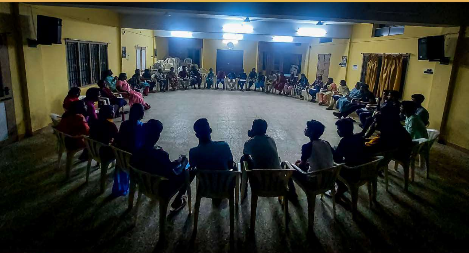
A view on Evaluation

At the end of each day of the rural camp, students gathered in a common hall for assessment. The evaluation was conducted on a daily basis under the guidance of each faculty, who took in charge for that day. The camp review & assessment was conducted around 9.30pm. During evaluation, students & in charge faculty sat in a circle form. Next to that, each committee explained the activities they had done that day. First, faculty mentored the mission & vision of the rural camp. Then the faculties highlighted each groups work over the day and explained them, how to rectify their flaws. At the end of the assessment, students also shared their feedback on other committees. Then, each committee outlined their action plans for the next day.