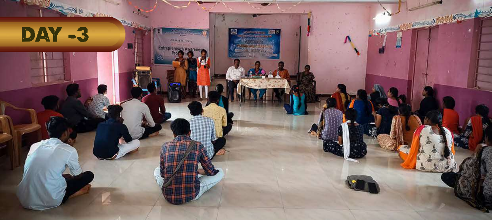
Trainee welcoming the resource person with warm speech