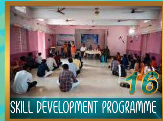
SKILL DEVELOPMENT PROGRAMME