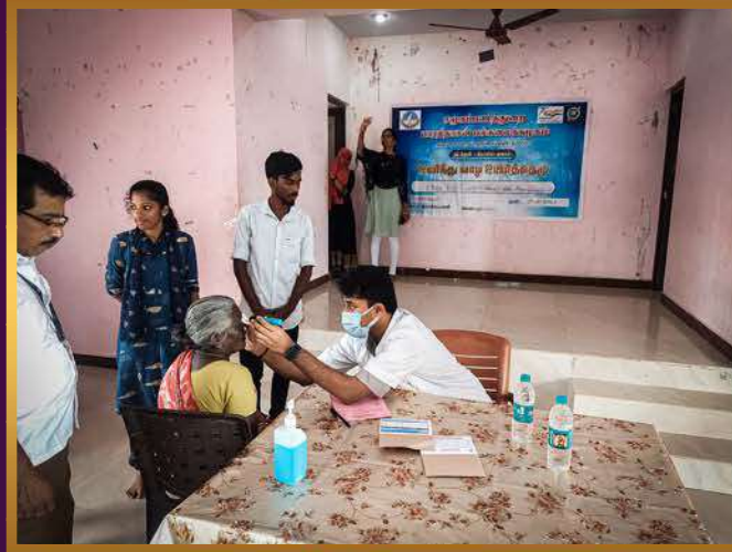
Doctor conducting the ophthalmoscopy to the elder