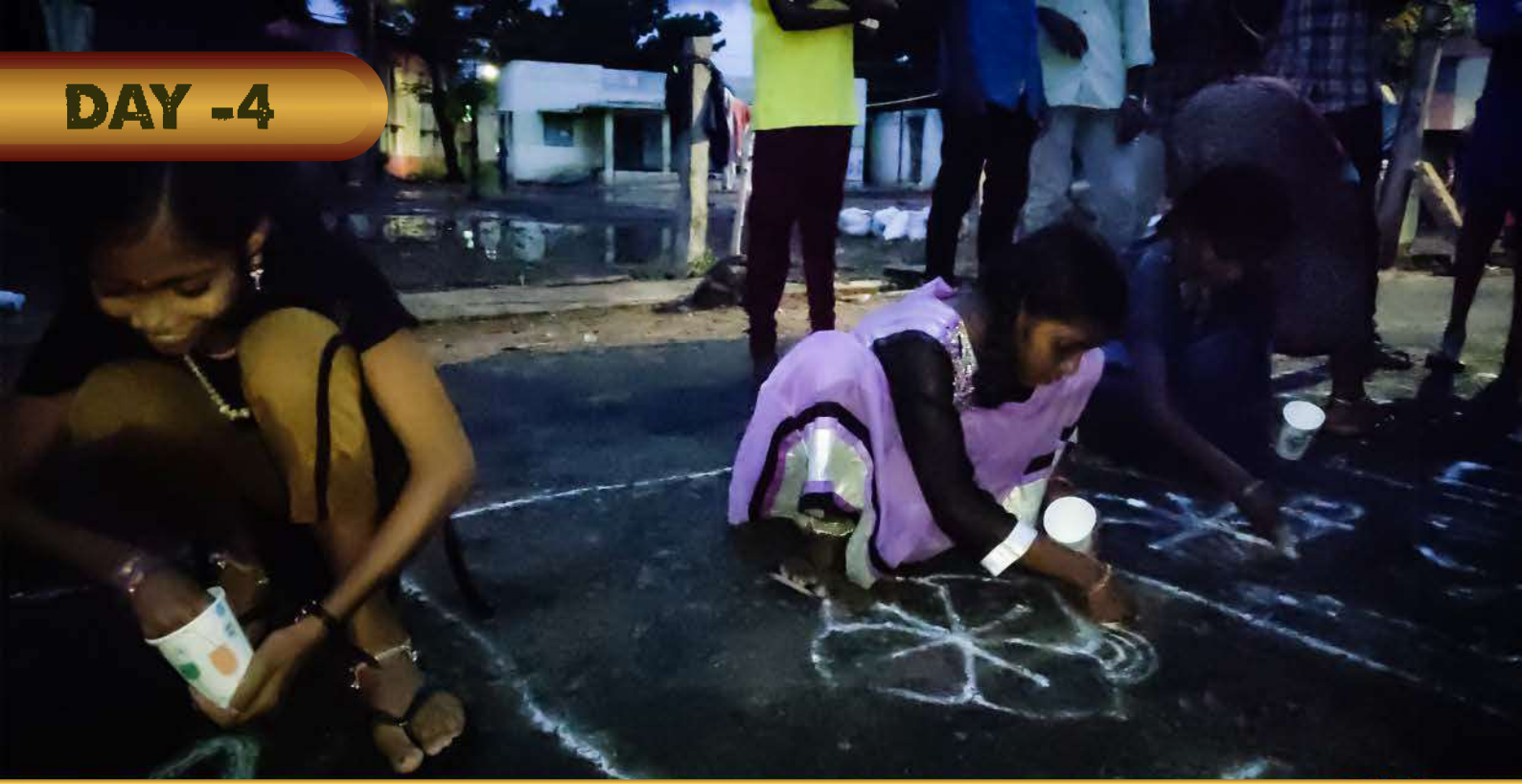
Housing Unit children enthusiastically participating in KOLAM competition