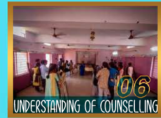
UNDERSTANDING OF COUNSELLING