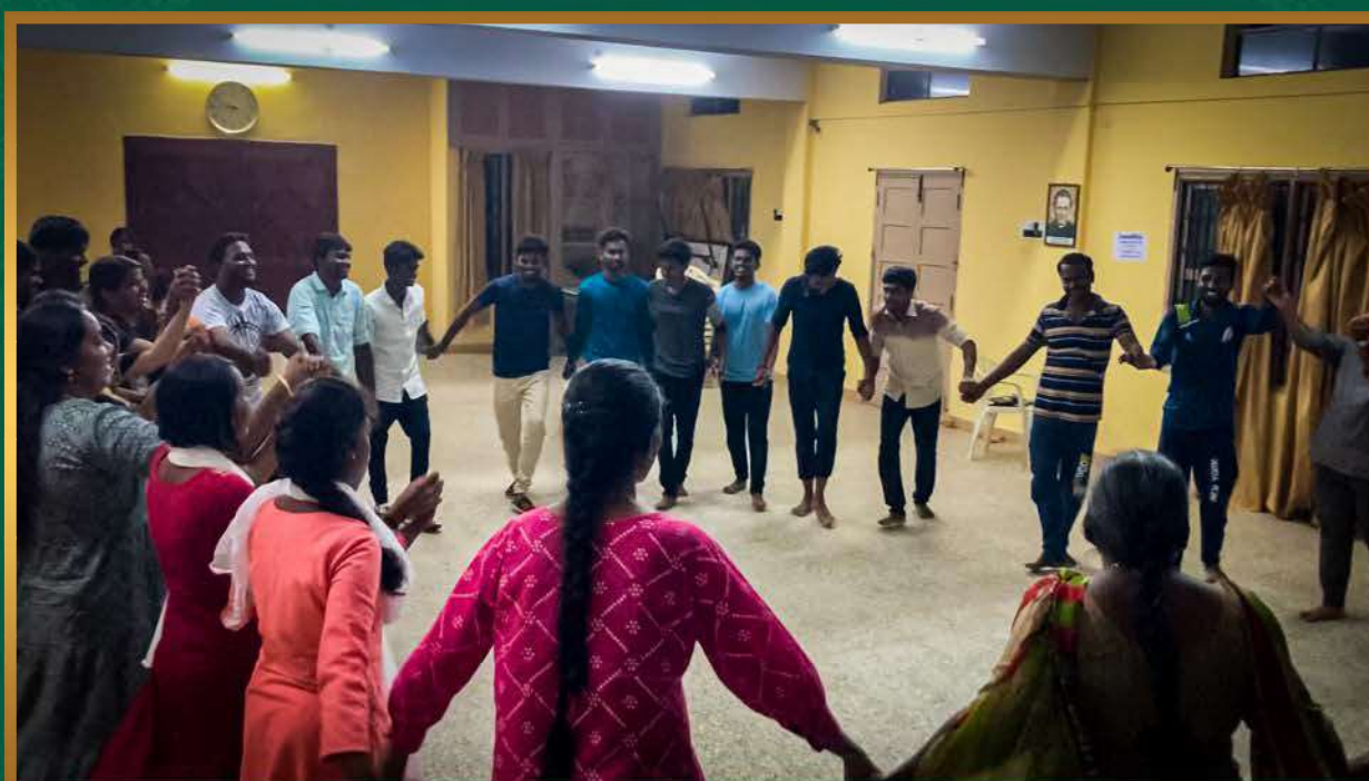
A view on campfire performance