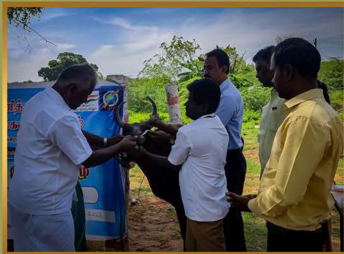
Professors and President of Mekkudi in the veterinary camp