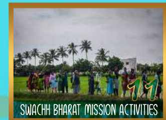
SWACHH BHARAT MISSION ACTIVITIES