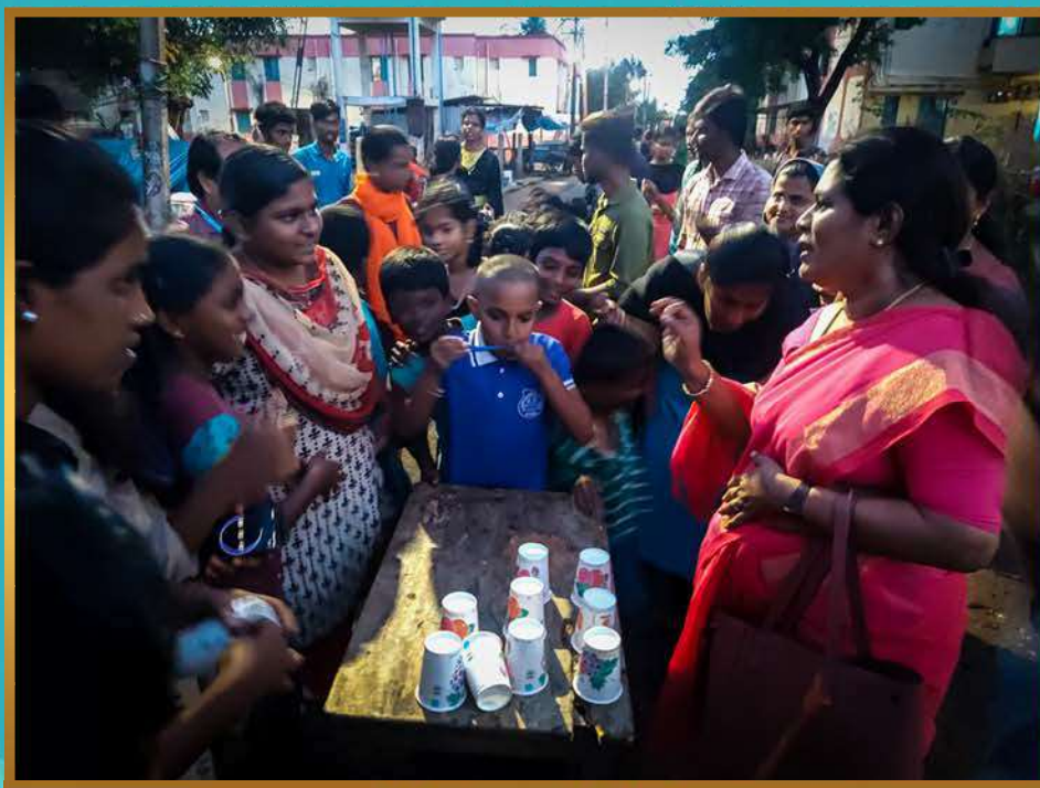
Trainees conducting games competition for the Housing Unit childrens