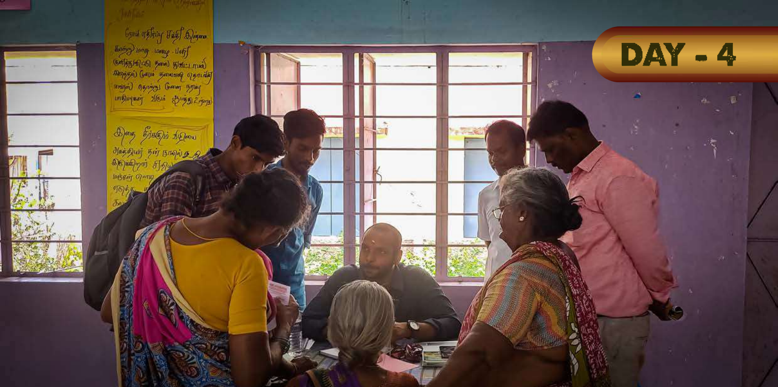
Professor & Head of the Department visits the Naturopathy Camp