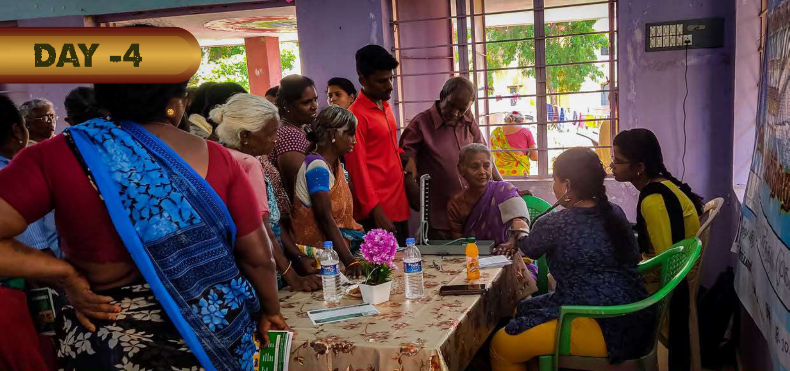
Doctor conducting general check up for the community people