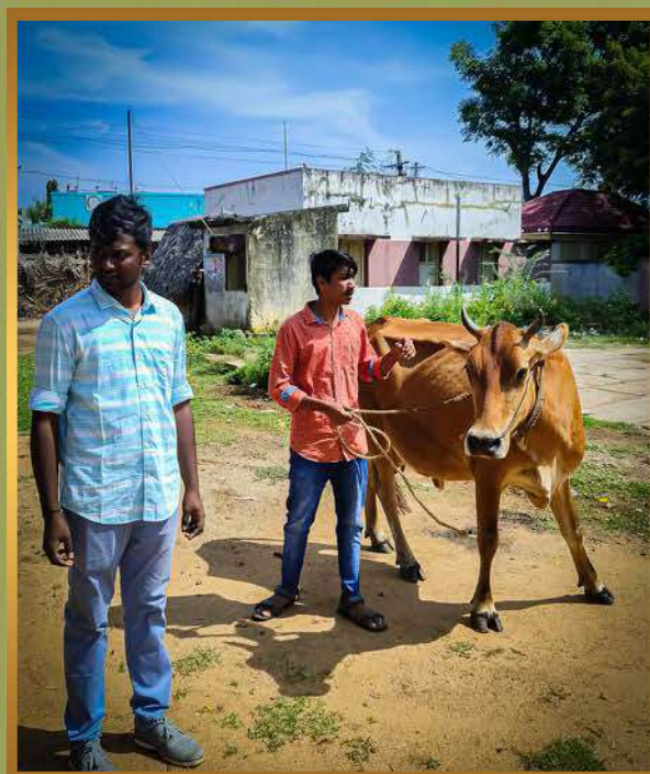
Trainees helping the cow to get medication